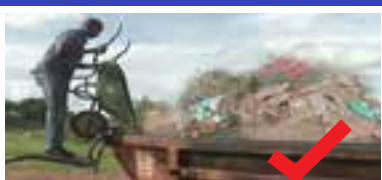
Only garden refuse and building rubble